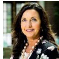
Janet Nelson Manor House Event Center